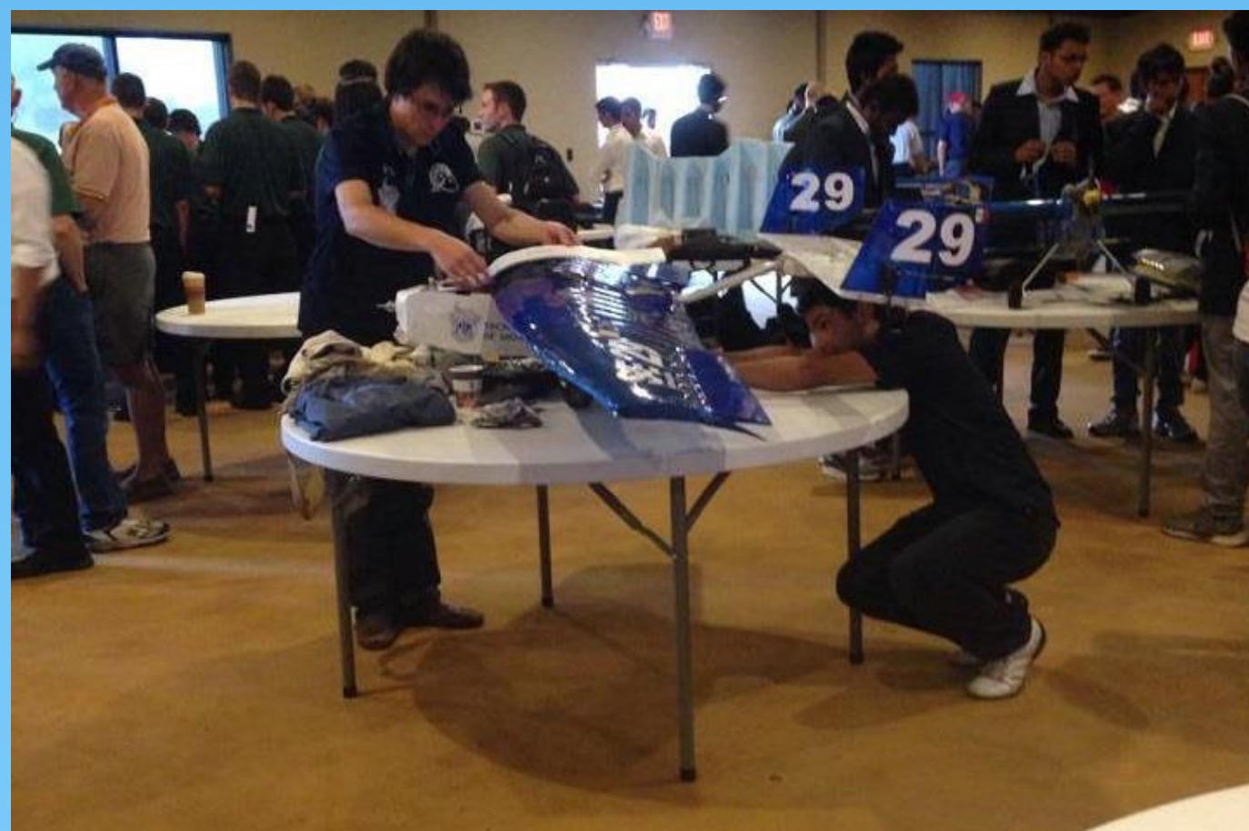
Pictures of 2014 West Competition