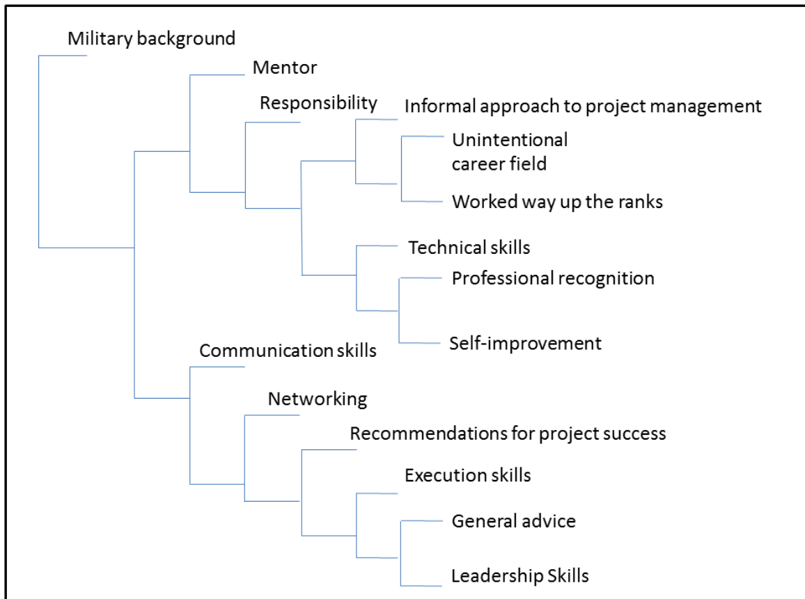
Figure 2. NVivo correlation coefficient between common words and themes

Another approach taken to evaluate the degree to which each theme is related is to examine the similarity of words used in each theme. In this report generated by NVivo 9 based on the correlation coefficient measuring the relationship of common words found between themes, obvious relationships are illustrated in Figure 2. For example, in the network diagram resulting from the NVivo 9 analysis, we see two major groupings of themes based upon their relatedness. The upper portion of the diagram could be viewed as themes associated with the “hard skills” or “task oriented” side of project management (i.e. technical skills, self-improvement, professional recognition, working way up the ranks, responsibility), while the lower portion could be view as themes associated with “soft skills” or “relationship-oriented” skills (i.e. leadership, networking, and communications). It is interesting to note that the theme of “execution” is found in this path. It should not be surprising that the theme of execution was found amidst discussion of leadership and communication.