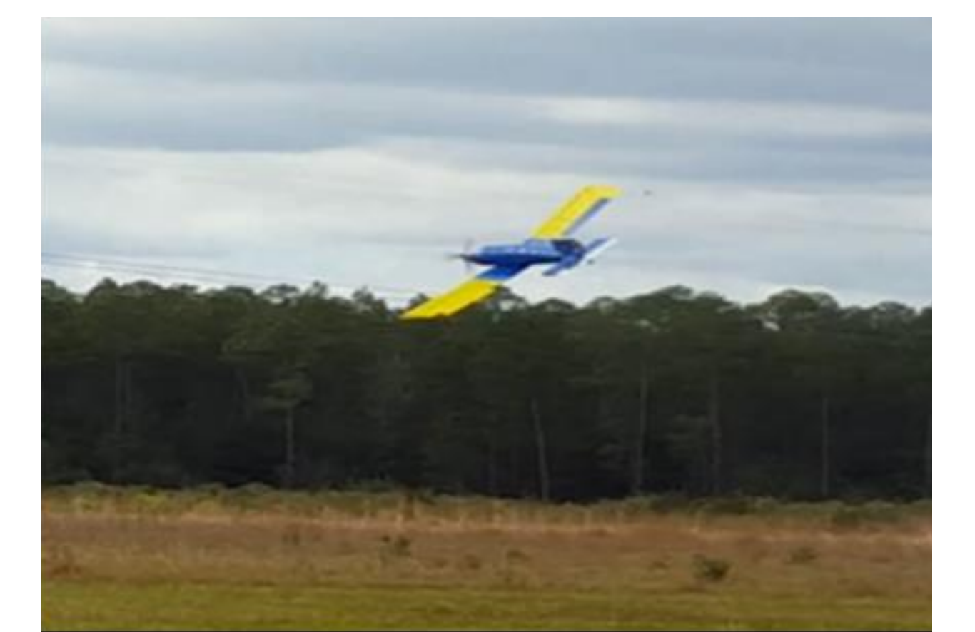
Above: Production Aircraft in-flight photo.