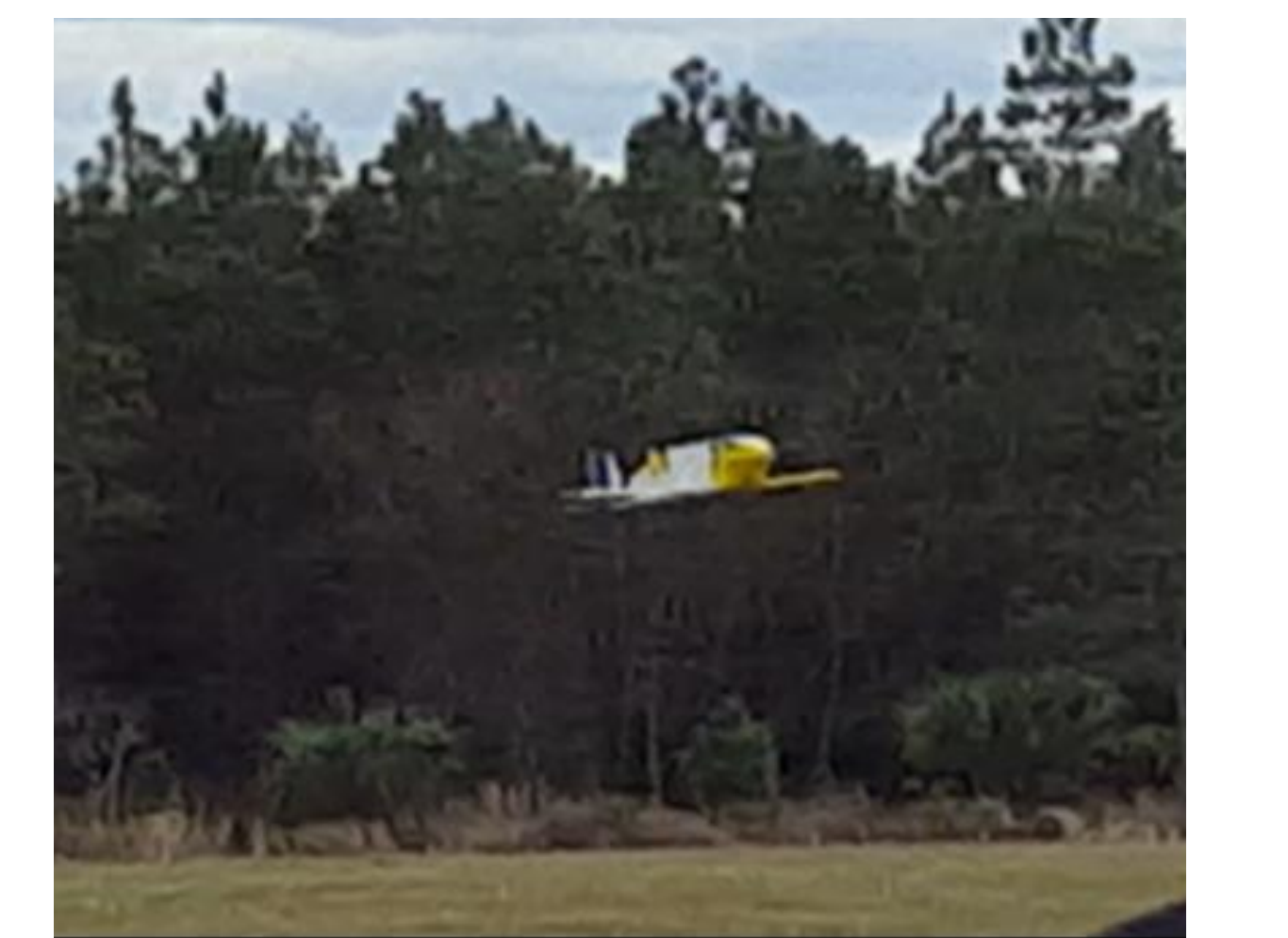
Above: Manufacturing Support Aircraft in-flight photo.