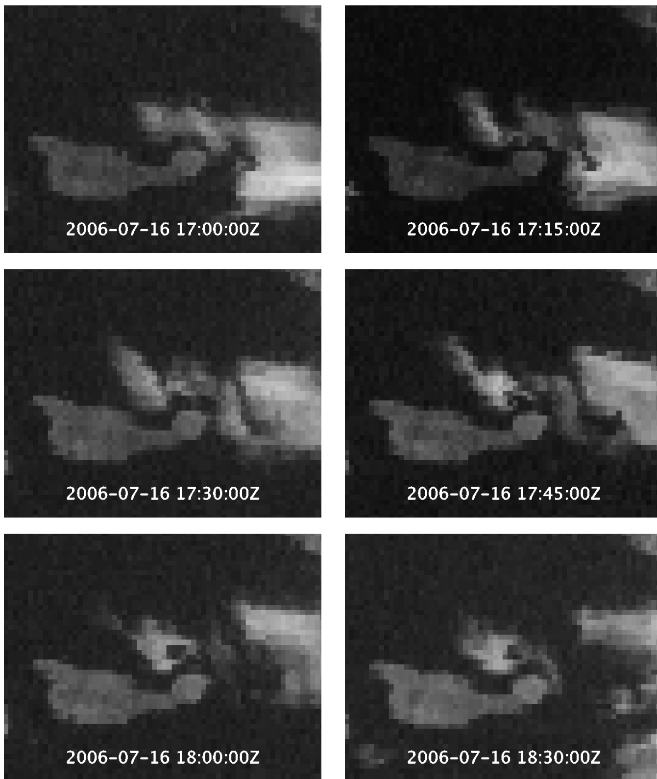
Figure 2. GOES-West visible satellite images from 1700 UTC to 1830 UTC on 16 July 2006. In this sequence, dry, cloud-free air in the lee of Santa Cruz Island can be seen moving laterally into the circulation followed by a tongue of clouds wrapping around and closing off the eye. The satellite image from 1830 UTC shows the same cloud as Fig. 1. North is “up” or toward the top of the page (cf. Fig. 1).