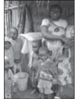
The Manz Biosand Filter shown in this photo was constructed by members of the community in Nkuv, Cameroon, West Africa, after receiving training from Hope College engineering and nursing students.

The spring break trip was followed by a pilot implementation trip in May 2006. At the conclusion of the May trip, it was still evident that our team was really comprised of three separate discipline specific teams engaging only superficially in interdisciplinary work. Each group was still developing and testing their area of expertise. Once the students were proficient in their discipline specific areas, we saw a shift in thinking and interaction among the students.