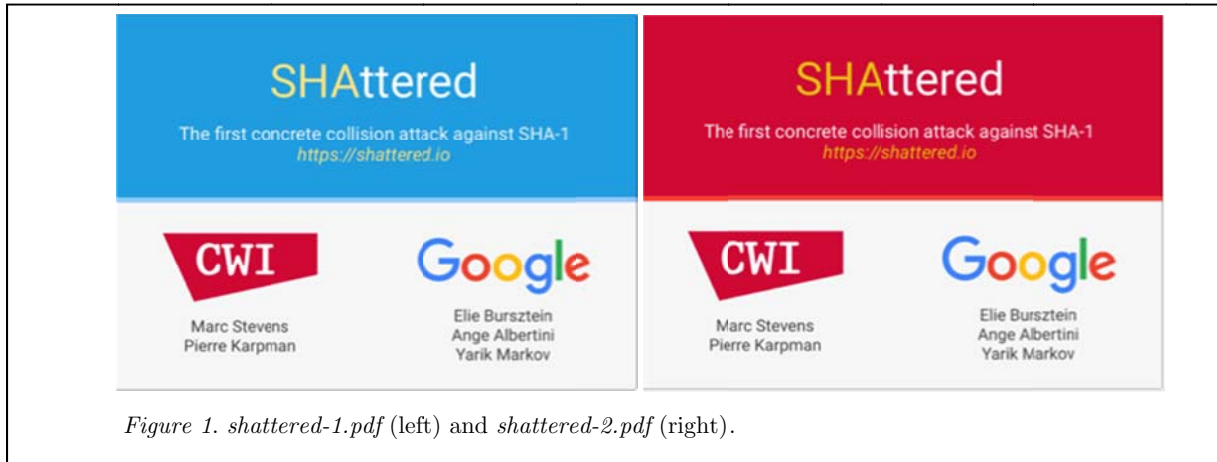
Figure 1. shattered-1.pdf (left) and shattered-2.pdf (right).

To address the research questions, two files were needed that were the same size, had the same SHA-1 hash, and had different content. Centrum Wiskunde & Informatica (2017) provides such a pair of 422,435-byte files, called shattered-1.pdf and shattered-2.pdf (Figure 1).