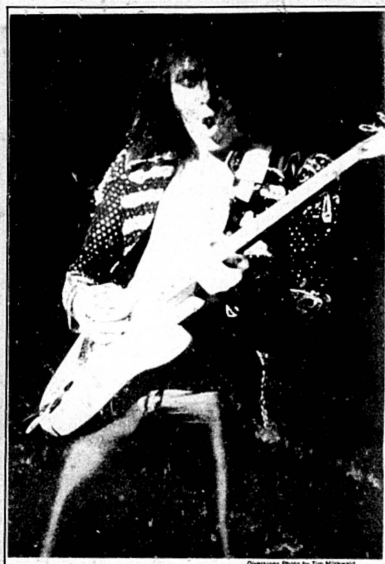
Diversions

"I believe (Jimi) Hendrix only opened the door for the music which we have today", Yngwie said during a post-show interview. "His influence is apparent but I don't want to be compared," when referring to his guitar solos.