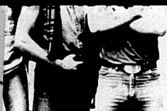
ms ★ Brian Johnson ★ Simon Wright

The concert began with a raging set off of their earlier albums that kept the crowd sizzling in their seats. Encore after encore AC/DC kept up the pace, finally climaxing in their super-hit single, "For Those About To Rock (We Salute You)".