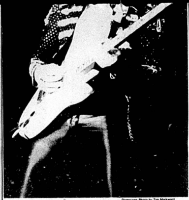
Diversions

"I believe (Jimi) Hendrix only opened the door for the music which we have today", Yngwie said during a post-show interview. "His influence is apparent but I don't want to be compared," when referring to his guitar solos.