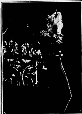
Diversions

Playing the guitar with his teeth, reminiscent of Jimi Hendrix, and swinging it around his neck, revealed the showmanship of the 22-year-old performer.