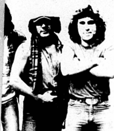
ms ★ Brian Johnson ★ Simon Wright