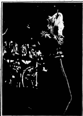
Diversions

Playing the guitar with his teeth, reminiscent of Jimi Hendrix, and swinging it around his neck, revealed the showmanship of the 22-year-old performer.