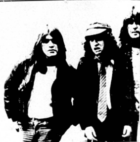
Malcolm Young * Angus Young * Cliff Williams

It's A Long Way To The Top Problem Child