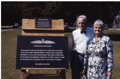
Plaque dedication: October 25, 1975

Editor's note: I wasn't aware of the existence of the 'Commemoration Book' until I saw it in Clewiston Museum in June. But it is there, safe, and photographs below prove it! I will now try and trace the second copy given to the RAF Museum Hendon in 1979.