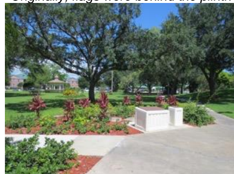
5BFTS plaques on their new plinths - 2016