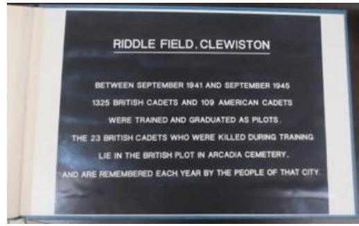
Inside back cover