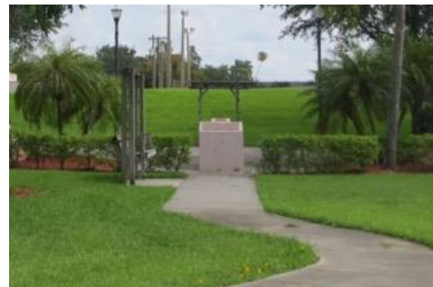
Plaques in Garden of Remembrance 2014. Originally, flags were behind the plinth