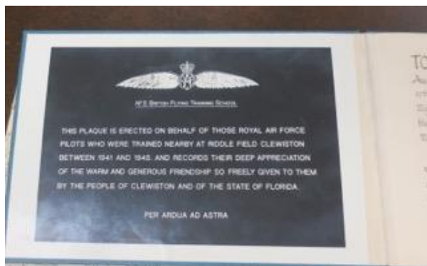
Inside front cover