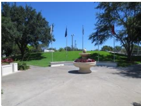
New Garden of Remembrance - 2016