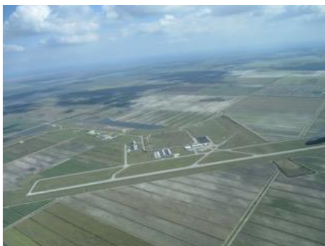
Riddle Field (Airglades) from the air February 2017