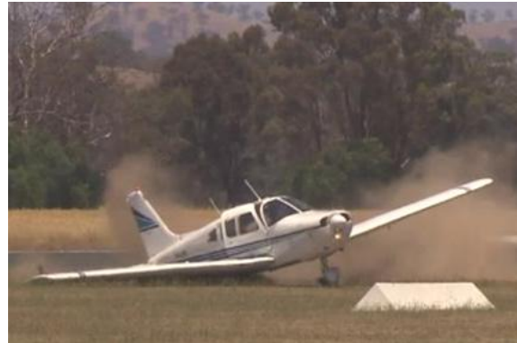
January 2013 Mangalore, Australia