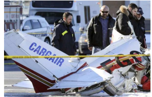
March 2017 Montreal, Canada