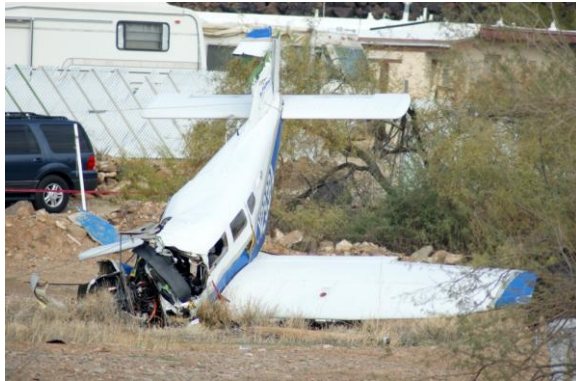
January 2010 Phoenix, USA

...with positive and negative outcomes due to ELP