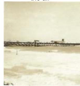
Pier at Palm Beach