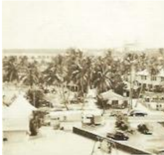
View from the hotel