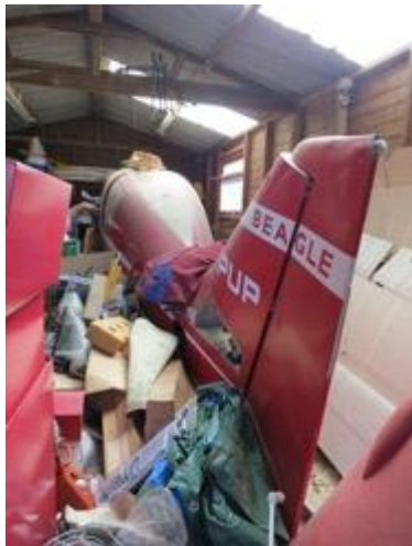
Beagle Pup: First sighting - 2014