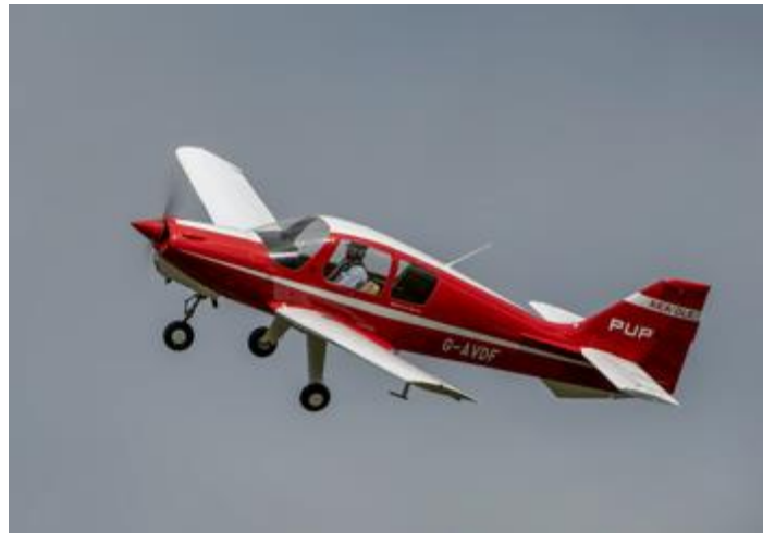
In the air again! August 26, 2020 - Pup Press Day