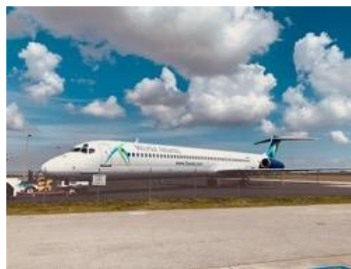
A real contrast: MD-80 jet at Air Glades – February 2021