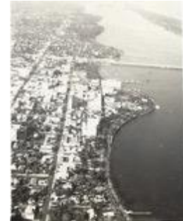
West Palm Beach from the air