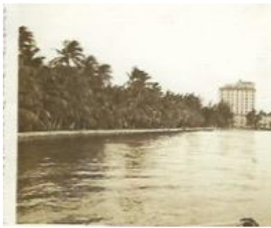
On the Ferry