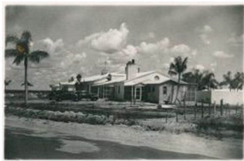
Carlstrom Field in the 1940s