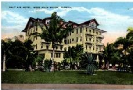
1930s postcard showing Salt Air Hotel