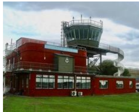
Old Air Traffic Control Tower, Linton-on-Ouse