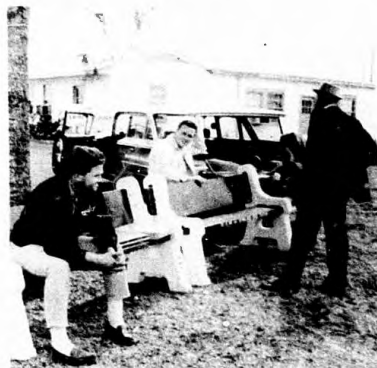
WHO PUT THOSE BENCHES THERE?