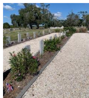
The British Plot, Oak Ridge Cemetery, Remembrance Day 2023