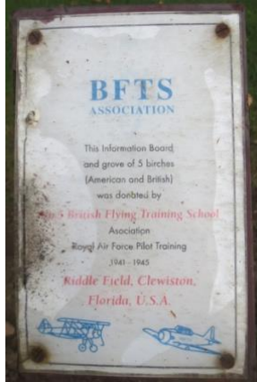
5BFTS board 2002-2016

And it was in 2001, that the 5BFTS Association agreed to donate at least £150 for a tree and a donor's plaque to be situated in the proposed RAF Grove. In addition, members were asked if they would like to give a personal donation. The final total was £1100, sufficient for a small grove of two English birch trees and three North American birch trees (5 for Number 5), a plaque and an information board, which stood in the shade of the birch trees which form an entrance to the RAF Wing site.