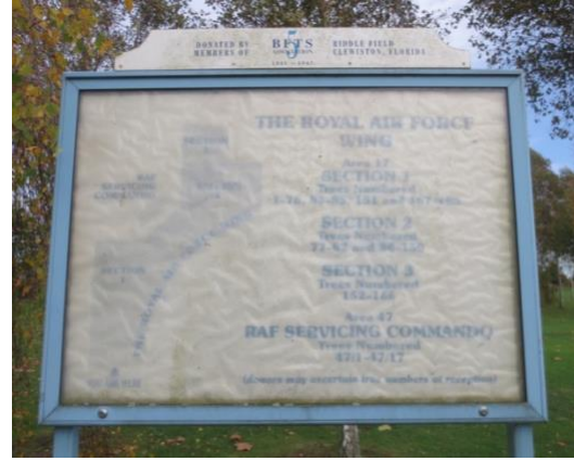
Information Board 2002 – 2016 by 5BFTS Grove at the entrance to the RAF Wing.

By 2014, the trees were growing well, but the 5BFTS board was shabby and the information board was virtually unreadable. By then the 5BFTS Association had been disbanded and all remaining funds distributed, but the agreement with the NMA included maintenance of the boards. Which is why, in 2016, the NMA placed a new plaque between the two central English birch trees.