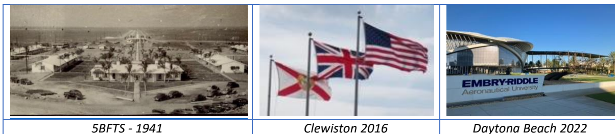
5BFTS - 1941