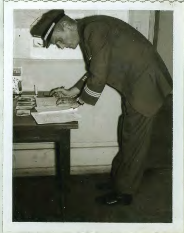
Weight & Balance Final Check