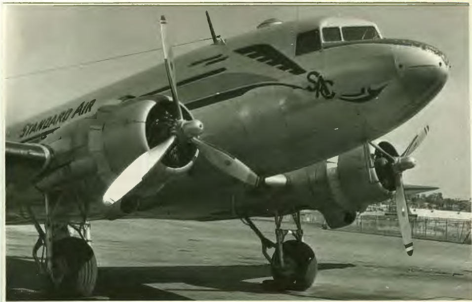
Seattle Mayor and City Council enroute to luncheon with Mayor & City Council of Yakima, Washington