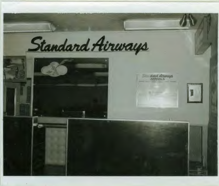
Pink trim Check-in Counter