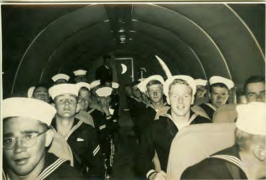
Navy on Leave 1948

The planes have been obtained as surplus from the government.