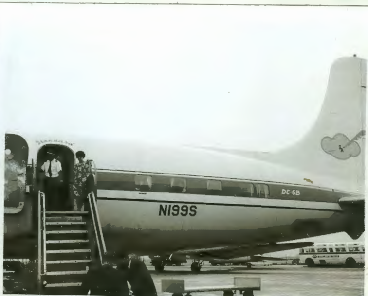
Morning Arrival San Francisco from HAWAII Muumuu Serving Uniform on Stewardi