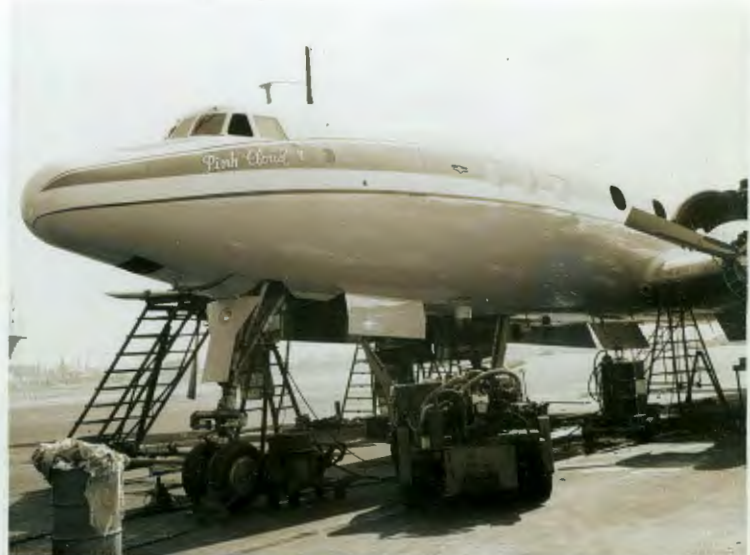
PINK CLOUD V Super "G" Constellation