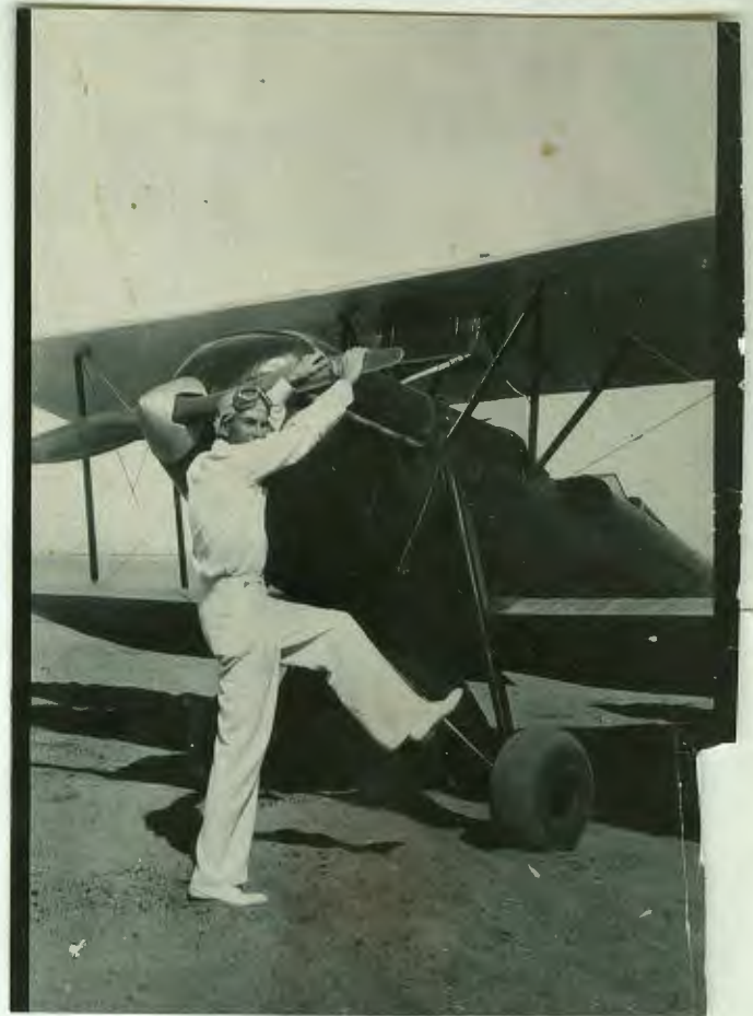
Original Plane - 0X5 Waco