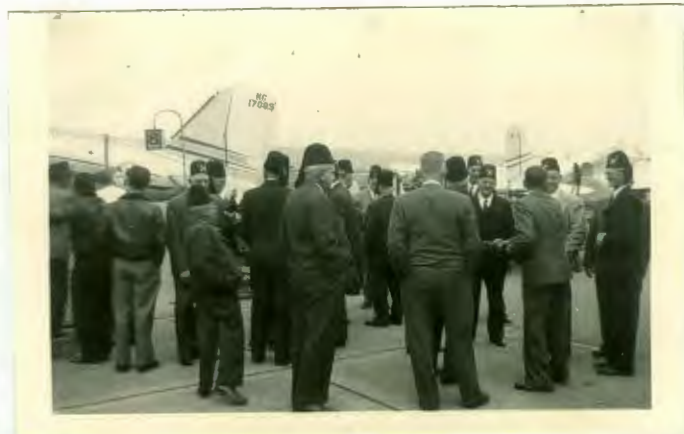
Shriner - Charter Seattle, Washington - 1947