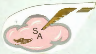
PINK CLOUD N117A