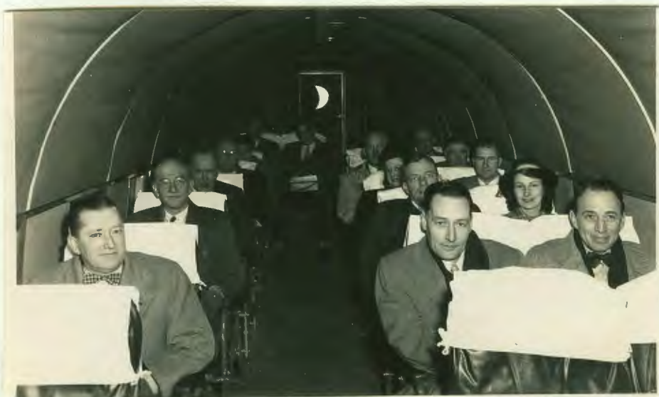
OCCASION Introduction of Coach Service by Standard from Seattle - 1947