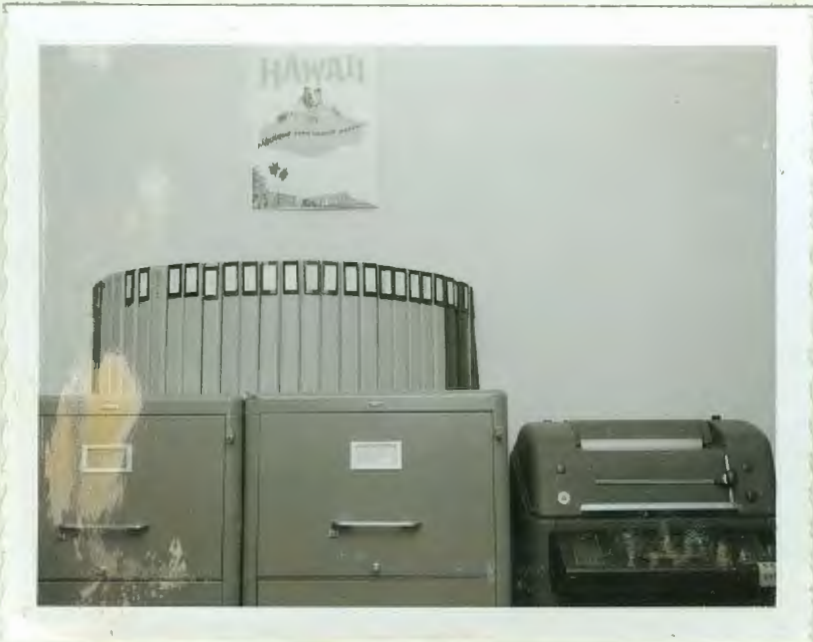
Crew Records and Teletype for Military Commercial Air Movements