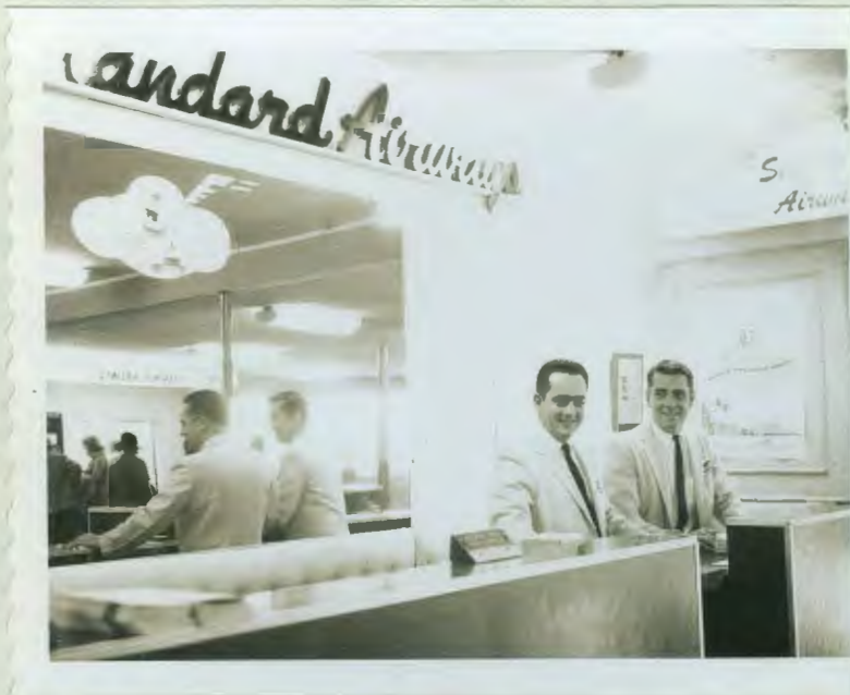
Pink Jacketed Check-in Personnel Reflected in "Pink" Mirror