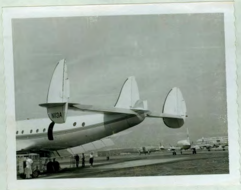
PINK CLOUD N113A