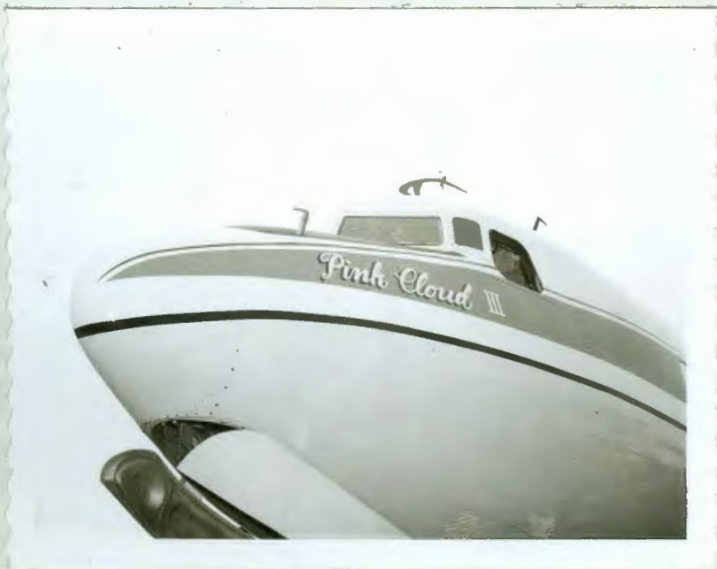
PINK CLOUD III Douglas DC-6B