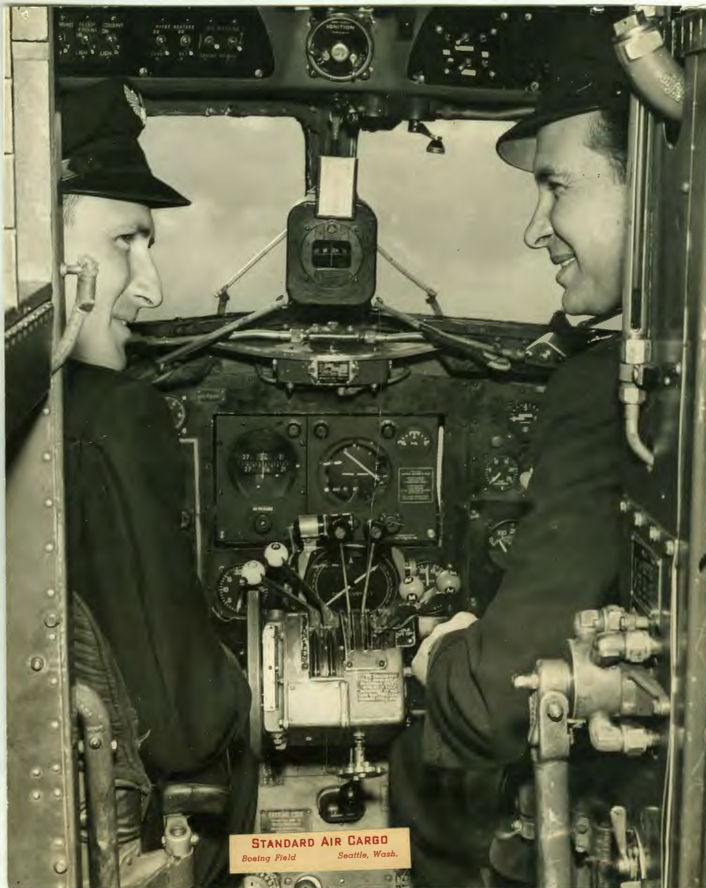
STANDARD AIR CARGO Boeing Field Seattle, Wash.