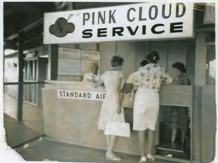
Check-In at Honolulu International Airport