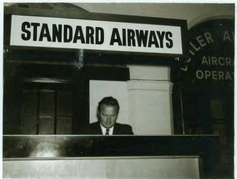
SAN FRANCISCO Check-in Counter