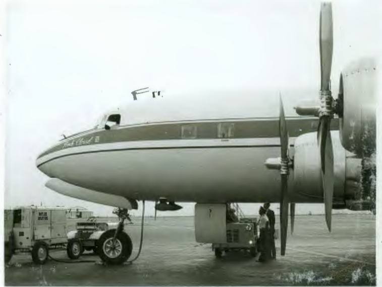
"PINK CLOUD III " DC-6B White top Grey stripe Pink Lower half