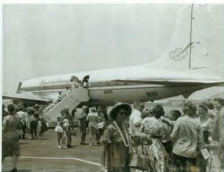
Happy Customers Returning from HAWAII