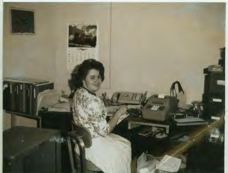
Paper Work Department Staff