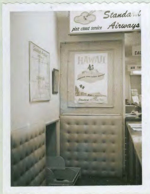
Burbank Check-in Counter