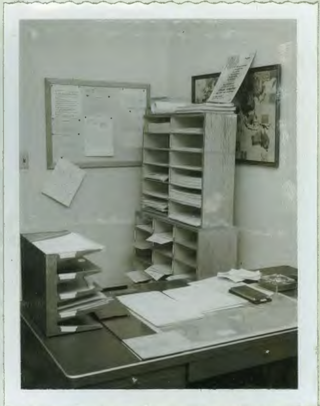
Crew Mail Boxes Flight Ready Room