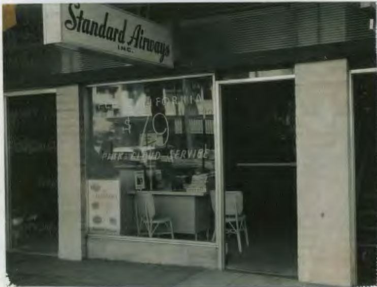
Office - 2159 Kalakaua Waikiki Beach