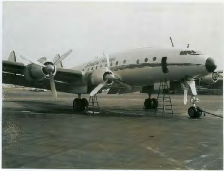
PINK CLOUD I Lockheed 749A