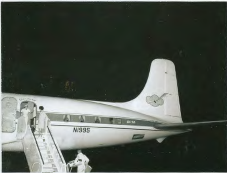
Ready to Board for Night Flight to HAWAII Pink uniformed Stewardi