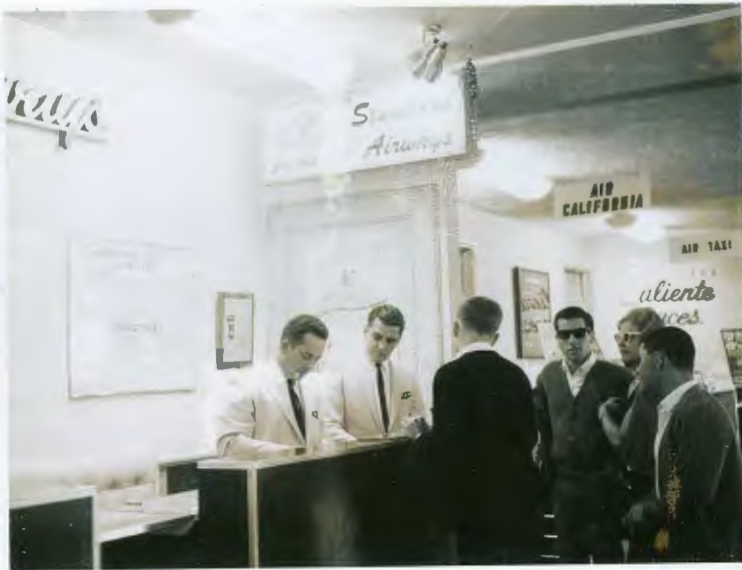
Check-in Customers Destination Hawaii