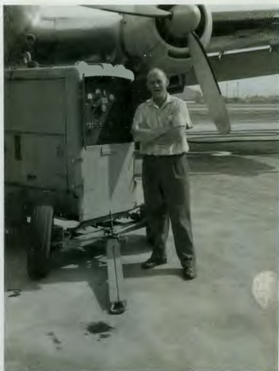
Maintenance Coordinator on the job