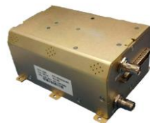
NGT-2000/2500 UAT IN/OUT ADS-B Wx & Traffic to iPad