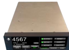
1090ES Transponder ADS-B Wx & Traffic Display