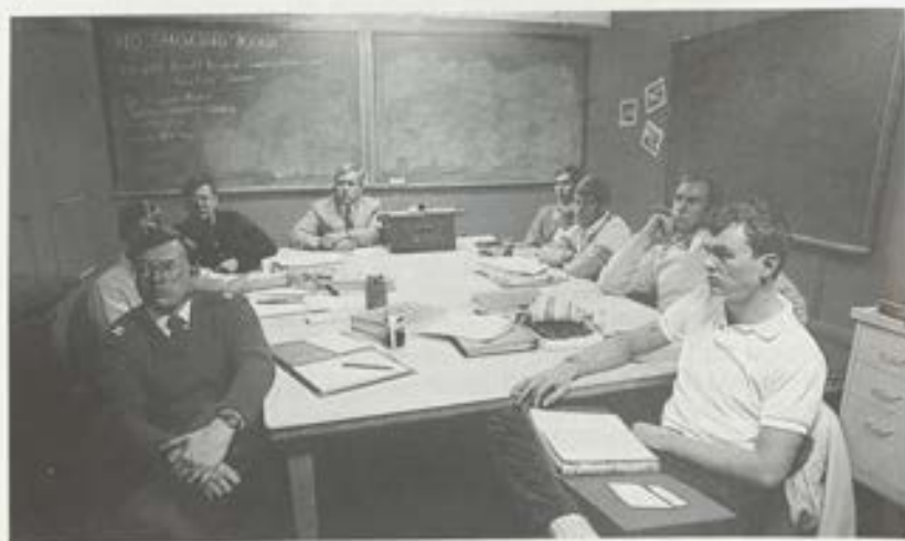
Graduate students at one of Embry-Riddle's Continuing Education Centers

All Embry-Riddle Aeronautical University degree programs have been approved by the appropriate state approving agencies for the enrollment of veterans eligible for United States Department of Veterans Affairs educational benefits. Embry-Riddle Aeronautical University is also certificated by the Federal Aviation Administration (FAA) under Regulation Part 141 (Pilot Schools) and Part 147 (Aviation Maintenance Technician Schools).