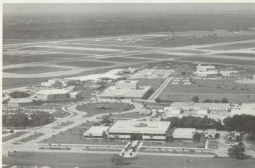
Daytona Beach campus