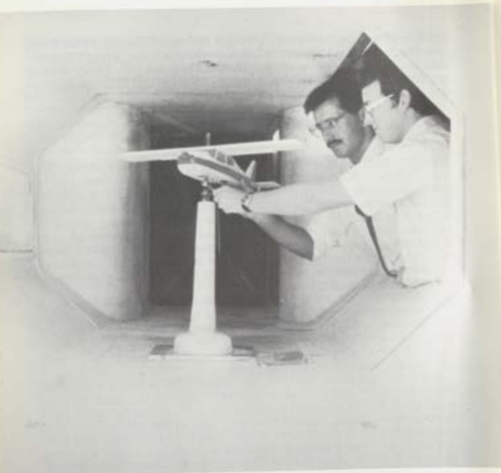
Graduate students prepare a model for wind tunnel testing.