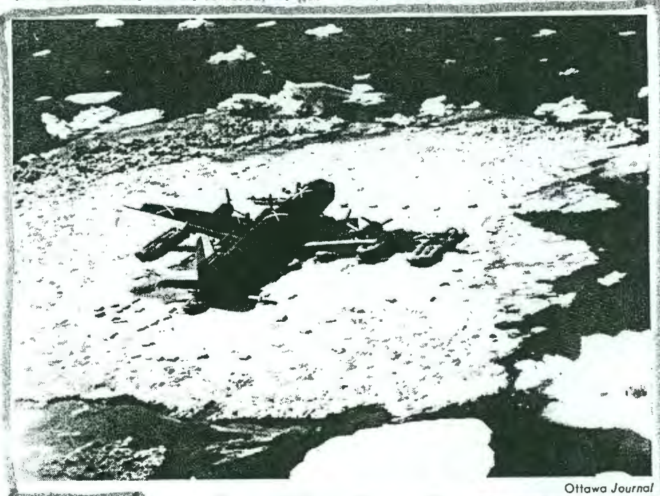
CRIPPLED DC-4 IN HUDSON BAY Pilots were betting ten to one.

A crowd was on hand to applaud the feat, but Pilot Mills Bale, whose emers