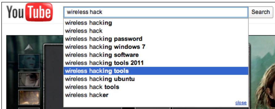
Figure 11: Choosing a suggested search term in YouTube

In this example the search term executed was 'wireless hacking tools'. The following part of the URL, ' &aq=6 ', indicates which search term was selected from the drop down menu. In this case it was the seventh suggestion as numbering starts from zero. This can be seen in Figure 11. The final part of this URL, ' &oq=wireless+hack ', indicates how much of the search term was physically typed in by the user before selecting the suggested search term. In this case 'wireless hack' was typed, also shown in Figure 11.