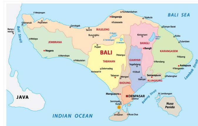
The 9 Regencies were also the former kingdoms of Bali (BaliGuide.com)