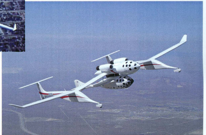
SpaceShipOne / White Knight