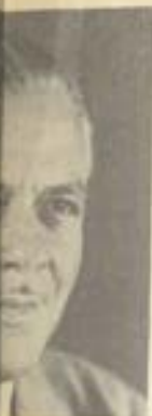
Y, OUR BOSS TANT.