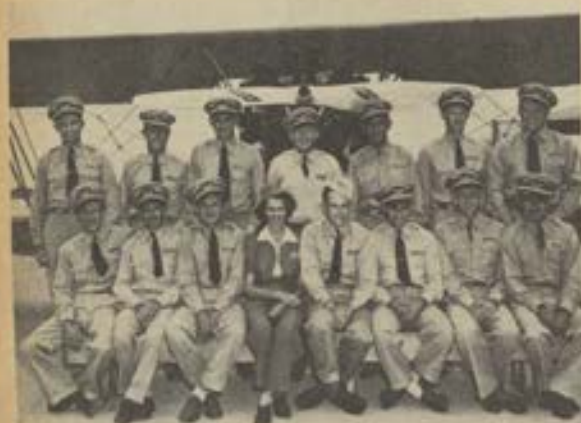
1. MIAMI - PRIMARY CPTP GROUND SCHOOL CLASS AT THE UNIVERSITY OF MIAMI.