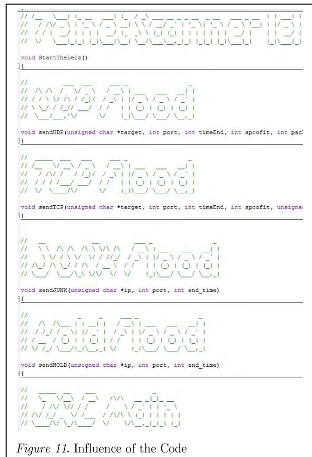
Figure 11. Influence of the Code

that is still available on the page of GitHub user ‘gh0std4ncer’ [ Post stolen IRC bot source from Lizard Squad , 2015]. The first commit of this code was even titled “Post stolen IRC bot source from Lizard Squad.” This essential tool template was most used by individuals with some understanding of coding. The influences of this code can be seen in the lightaidra, STD, and other botnets [MalwareMustDie, 2016] in Figure 11.