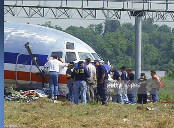
American Airlines 1420, Little Rock, AK. June 1, 1999

Since 2000, NTSB has issued 42 safety recommendations related to emergency response.