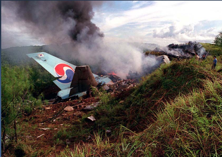
Korean Air 801, Guam. August 6, 1997