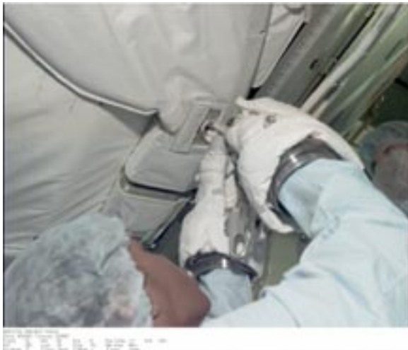
Photo # 12 - Tether fit check used to release CBM deployable cover launch locks during STS-88 EVA operations. The tether worked great on-orbit.

Fit checks of flight/flight-like tools to flight hardware is mandatory. Many the tools will work as planned, but until the tool is placed in with the flight there is no way to know for sure. The tool may fit the item perfectly, but the tool may prevent using the tool in the manner desired . Lessons learned, w check, use tools (or flight-like) that will be used during the on-orbit operat