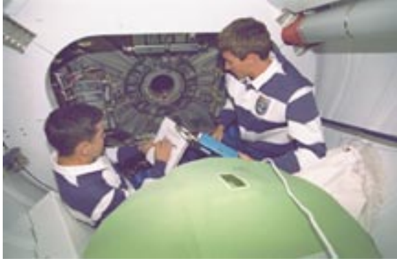
Photo#1 - Bob Caban and Sergei Krikalev are about to open the Unity Forward hatch allowing access into the Unity ISS element. Note the flight procedure being checked to assure proper steps are followed.