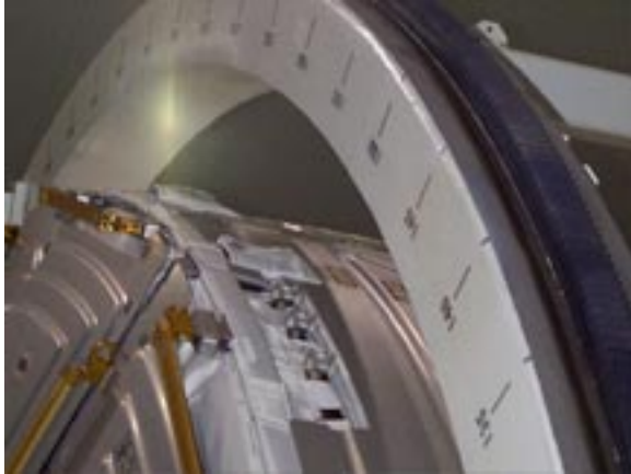
Photo #10 - ERS prevented check of 4-foot long CETA lightboom. Solution: fit check at the launch pad.