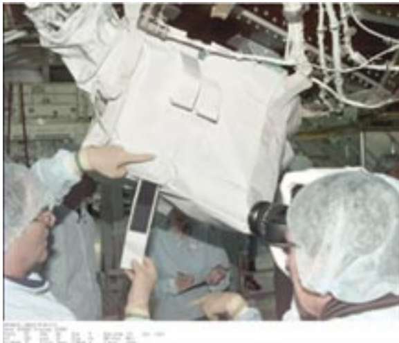
Photo #3 - Astronaut Terry Ross fit checks thermal cover that will be placed on the Unity Multiplexer/Demultiplexer during STS-88 EVA operations. Note additional micro location needed to secure strap.

As the name implies, these checks are static in nature. Examples include an EVA fit check of thermal blankets, electronic boxes and an IVA electrical fluid connector to the Unity. Because Unity is the core element to ISS, 5 future flights will be many Electrical and Fluid cables/connections between Unity and the new ISS elements. A process was put in place to check all future fluid and electrical jumpers that will make these connections. This meant accelerating many future EVA jumpers to allow the fit checks to occur before Unity was launched. Some of the jumpers require tools that will be described later in this paper but most were a simple static mate to assure the two items would mate on-orbit. Lesson learned, perform fit checks even for static cases.