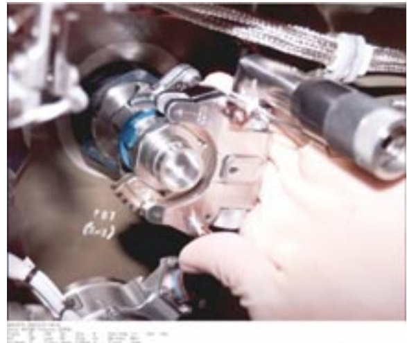
Photo #13 - Fluid fitting torque device had personnel need to assure surrounding hardware will not interfere with operat