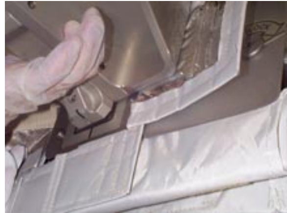
Photo #9 - CETA lightboom fit check to Unity including boom. Boom interferes with blanket not allowing boom to fully seat. Solution reposition blanket material.