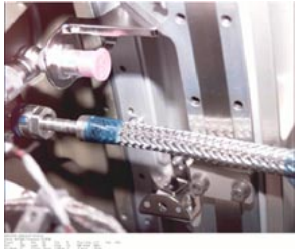
Photo #4 - IVA Fluid jumper mates proper to fitting but interferes with near-by structure. Solution, modify end of jumper with "S" fitting.