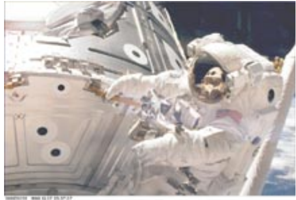
Photo#6 - Successful glove use during STS-88 EVA operations, in December 1998.