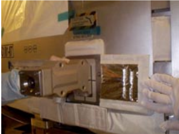
Photo #8 - CETA lightboom fit check to Unity minus boom. Fit check good.

Photo's #8 & #9 are of the Crew Equipment Translation Aid (CETA) lightboom fit launch Pad 39A. Photo #8 shows the CETA lightboom fit to Unity which fits just fine but when the boom is added to #9, i.e. now the boom assembly is in its flight configuration, the boom interferes with surrounding blanket material. Lesson learned, perform fit check in its flight configuration. Even a temporary installation of flight hardware is better than not having any hardware. Note: This fit check was very close to the flow so if the problem could not be solved quickly, delaying the launch may have resulted. Lesson learned perform fit check as early as possible with flight hardware in flight configuration.