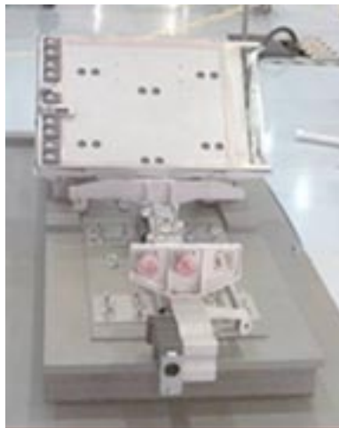
Photo#7 - Dynamic fit check of The S-Band Antenna Subassembly (SASA), not shown noted more space was needed between the high gain antenna and boom. Solution, modify

Dynamic fit checks deal with items that once placed in a desired location have dynamic components that if not exercised during fit check could cause a problem. This problem with the S-Band Antenna Subassembly (SASA) boom, SASA not. On-orbit the high gain antenna of the SASA can pivot and so this same operation was performed during the dynamic fit check and it was discovered more space was required between the high gain antenna and boom. This never would have been caught if performed a "static" fit check of the SASA to its boom. Lesson learned perform dynamic fit check not just static fit check if applicable.