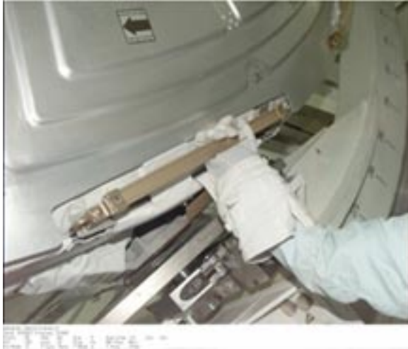
Photo#5 - EVA glove gets caught between handrail and shield. Solution place 1" spacer under handrail to allow more volume between handrail from shield.