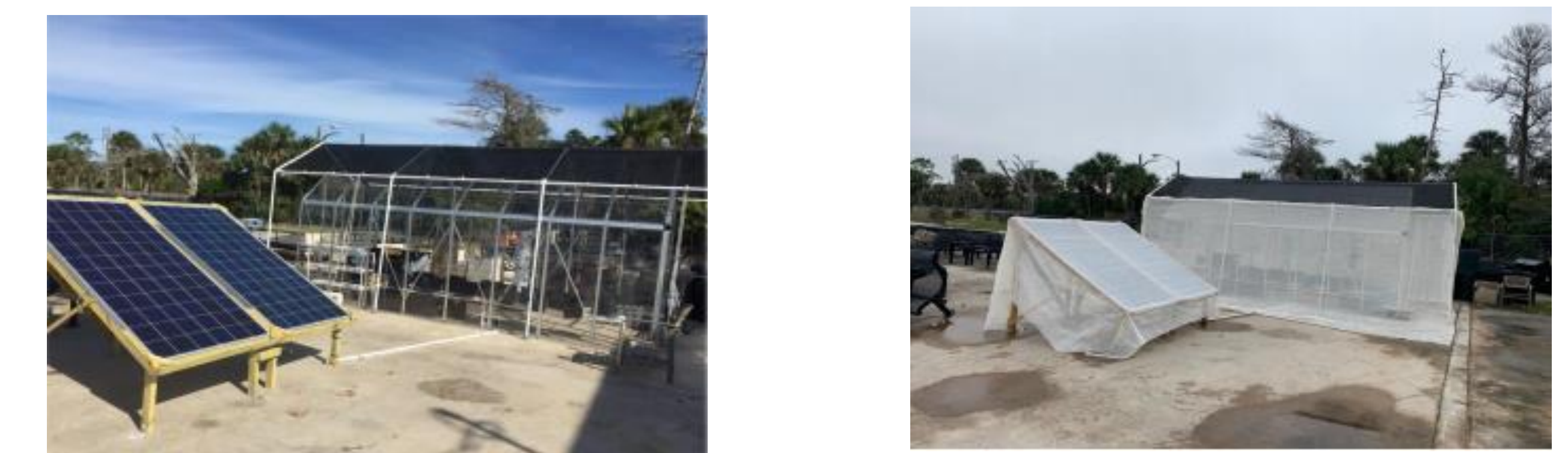
Figure 1: Greenhouse and solar panels