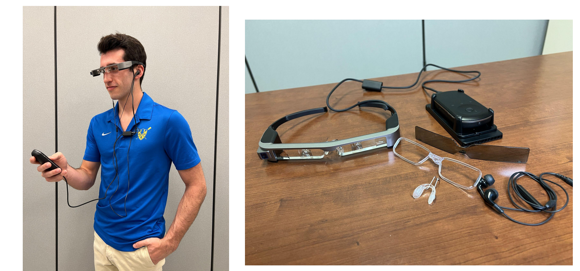
Figure 3. Epson Moverio BT-300 with Teather, Shade and Prescription Lense, Headphones, and Nose Inserts.