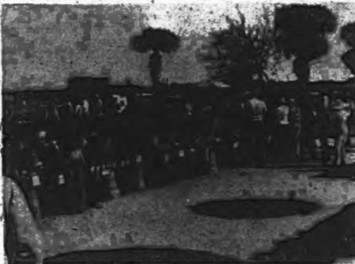
ANOTHER VIEW OF the market, showing here the fresh fruit vendors stocking their wares side by side.

Let me see: apples, cheese, sausage, bananas... what do all these things have in common? If you sold they are all sold at the Farmers Market, give yourself an A and go on down next week and experience it yourself!