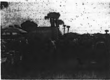
A VIEW OF THE Market Place. Notice the wise shopper's tote basket, right of center in the photo.

and leave as much milk, eggs, and butter as he thought we'd need until the next time! Somehow he always knew when someone was home to visit or when someone was gone. This was a time when we'd climb aboard the bread man's truck and he'd let us buy a nickel brownie for four cents and a promise to pay up "next time."