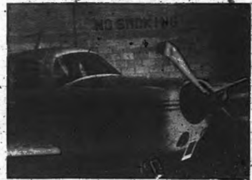
ONE OF THE DAMAGED MOONEY'S.