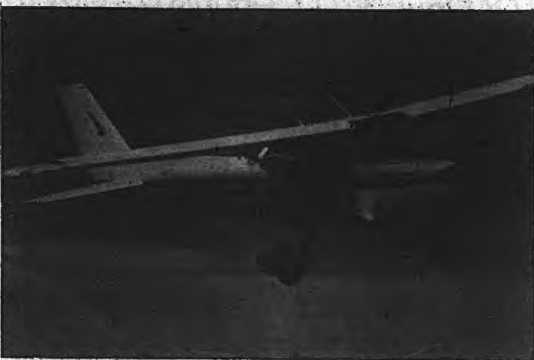
CESSNA'S 1981 SKYHAWK will have among other modifications, an increased payload, a larger wing fuel tank system of 62 gallons usable. Optional 50-gallon tanks are also available, in addition to the standard 40-gallon tank.

the battery and optional ground-serve-able have a higher current capacity for better reliability and performance of the battery power circuit.