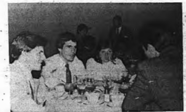
...while others greeted old and new friends.