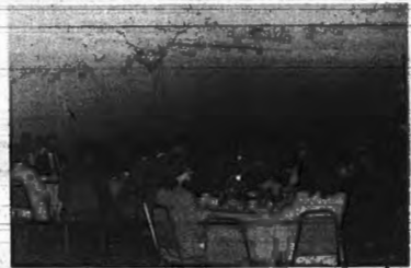
To many of the alumni present, the reception was like a class reunion...