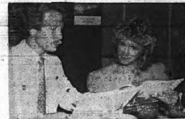
...some looked for pictures of themselves in old yearbooks...