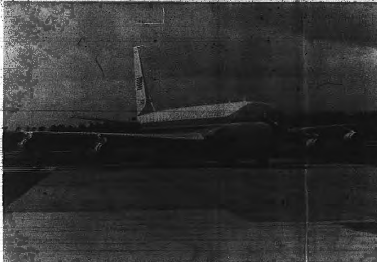
Air Force One taxis up to the terminal ramp at Daytona Beach Regional Airport. The airplane was here to deliver