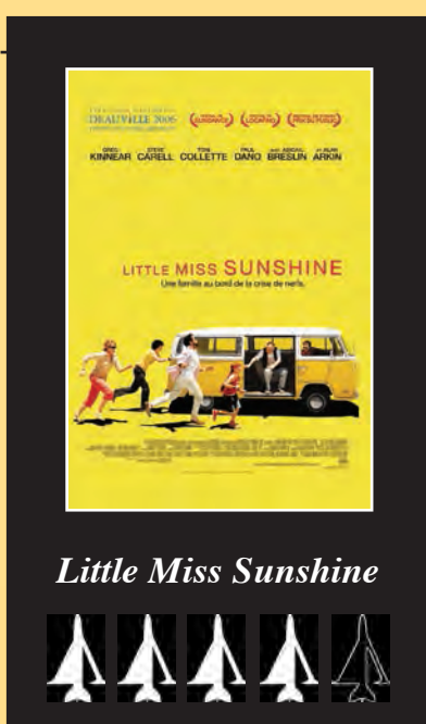
Little Miss Sunshine