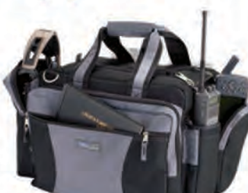
Original Flight Gear Bag 4974A $69.95