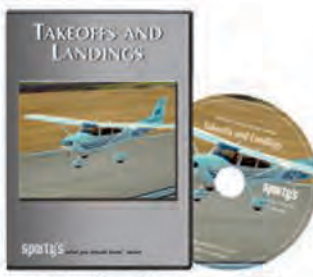
Takeoffs and Landings (DVD) D326A $29.95