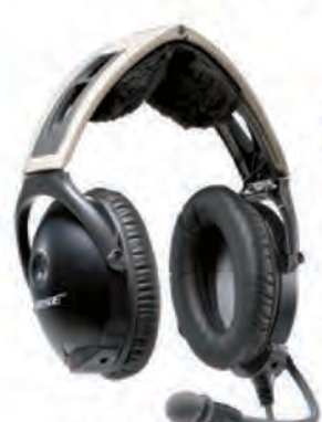
Bose Aviation Headset X 7087A $995.00