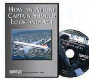
How an Airline Captain Should Look and Act (DVD) D927A $19.95