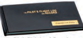
Pilot's Flight Log & Record 8120A $9.95