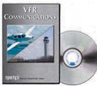
VFR Communications (CD & DVD) D852A $29.95.00