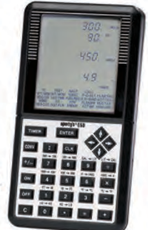
Sporty's E6B Flight Calculator E68A $59.95