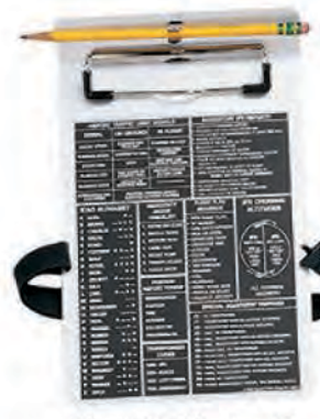
Classic VFR Kneeboard 7053A $49.95 $9.95