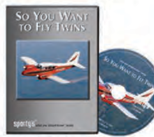
So You Want to Fly Twins (DVD) D238A $69.95