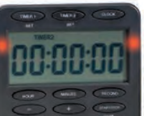
Sporty's Deluxe Flight Timer 4993A $24.95