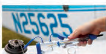
Heavy Duty Fuel Tester & Strainer B2087A $19.95