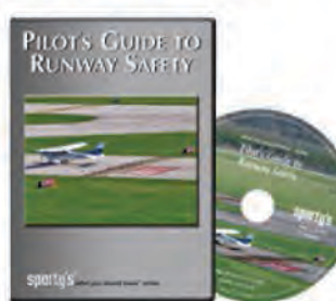
Pilot's Guide to Runway Safety (DVD) D764A $29.95