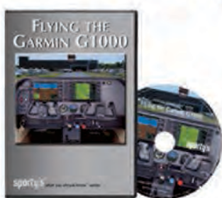
Flying the Garmin G1000 (DVD) D554A $24.95