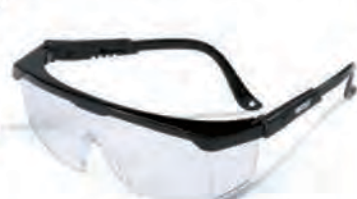
Instant IFR Training Glasses 1743A $14.95