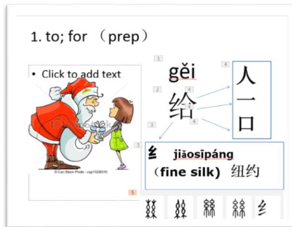
Figure 2. Character PowerPoint design.

During the explanation, the instructor will provide some examples of sentences in which the character is used. The PPT videos will be assigned to students to watch before class. Students are required to record the vocabulary and identify radicals and concrete words when writing character sheets. This “flipped learning” style will engage students in the learning process and helped students develop their awareness of radical and character knowledge, while becoming familiar with the vocabulary before class.