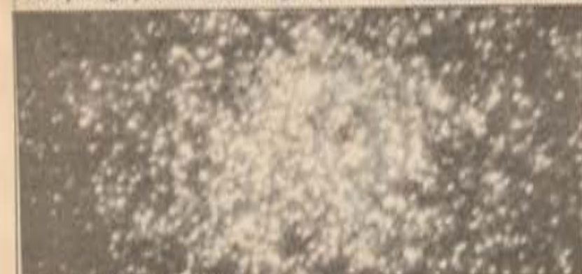
Star light, star bright...

The last shuttle mission was the first one which was dedicated to a single scientific discipline—astrophysics. However, other dedicated scientific missions are on NASA's slate for future shuttle missions.