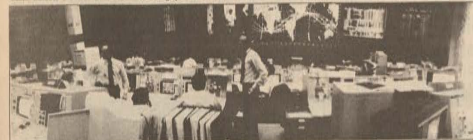
Mission control view...