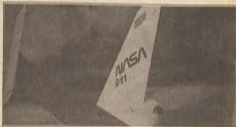
In an emergency, dial 911...

NASA purchased the Boeing 747-SR aircraft from JAL Airlines...it had logged 32,182 flying hours.