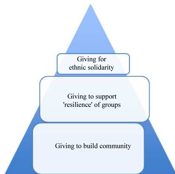
Fig. 2: Hierarchy of motivations- Remittances and philanthropy