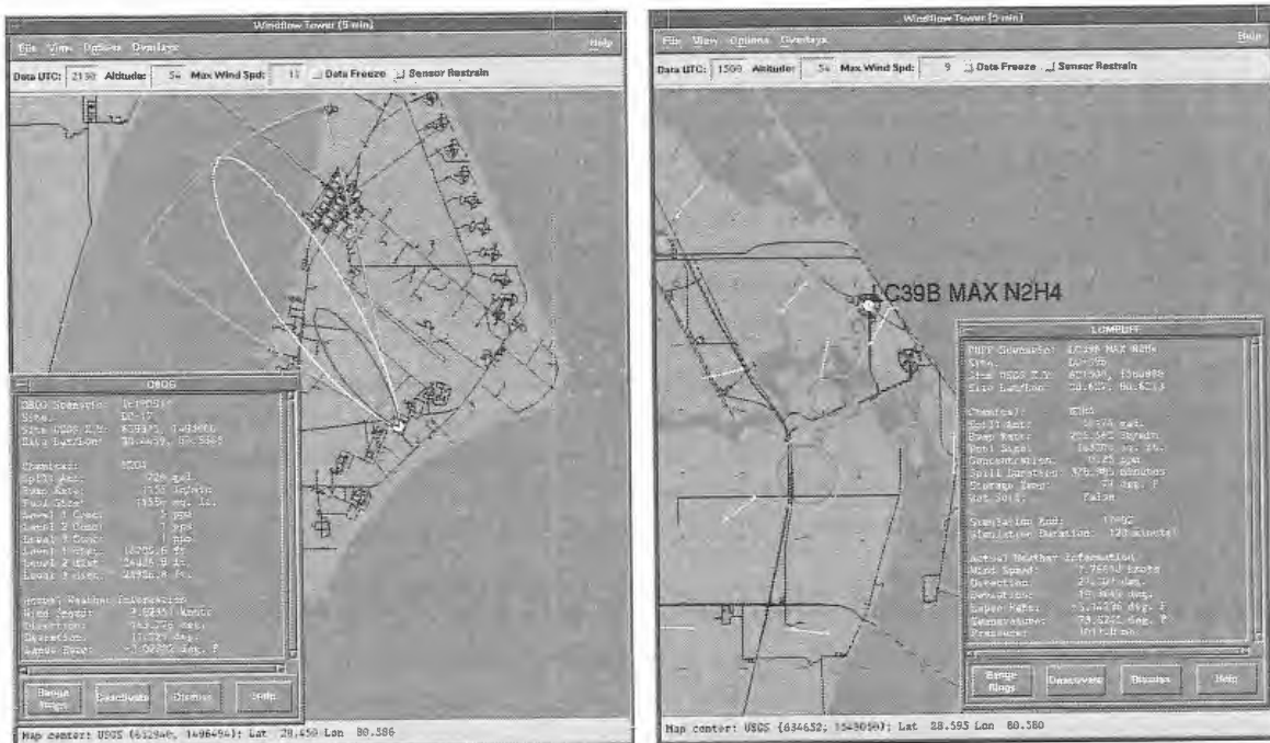
Figure 2. Windflow OBDG and LOMPUFF Displays

The primary map display for MARSS (designated 'Windflow') depicts wind data in two forms. Data may be displayed as standard barbs for a sensor at a specified height and as an interpolated wind field. Windflow also provides calculation and display of toxic dispersion predictions produced by Ocean Breeze-Dry Gulch (OBDG) and Local Meteorology Puff (LOMPUFF), and the display of Rocket Exhaust Effluent Diffusion Model (REEDM) output distributed by safety analysts.