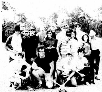
AVION TEAM - CANDID SHOT OF THE AVION SOFTBALL TEAM DOING WHAT THEY DO BEST

The Avion won its' second straight intramural league softball game Sunday with a victory over the Ball Busters. The Avion leads the league in runs scored with 57 in 12 innings of play. Come back from behind playing and that "Never Say Die" attitude, which seems to have become the motto of the team, has proven to be too much for the opposition. The Avion team meets the strong Sigma Phi team next Sunday at 11:00 a.m.