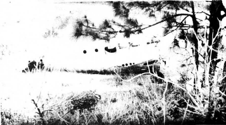
TO PRESERVE SECRACY--WORK BEGINS ON THE D-18 HOVERCRAFT WHILE IT IS HIDDEN DEEP IN THE PERUVIAN JUNGLE.

The E-RAU Engineering Department in conjunction with some A&P professors has come up with yet another plan for a D-18 conversion. The latest proposal calls for the installation of three Gnome Rotary engines. These engines will drive a five bladed rotor, thus enabling the aircraft to hover.