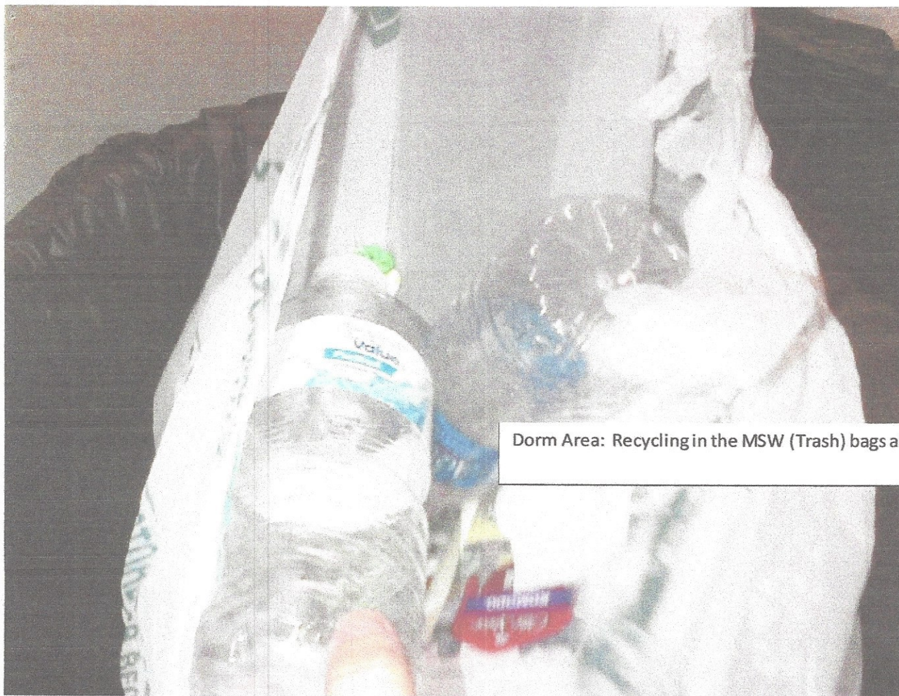
Dorm Area: Recycling in the MSW (Trash) bags along with th