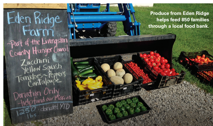
Produce from Eden Ridge helps feed 850 families through a local food bank.