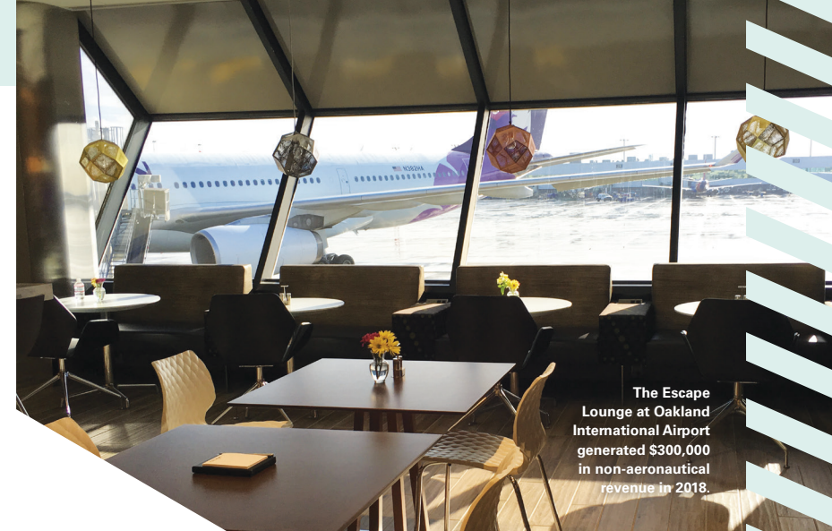
The Escape Lounge at Oakland International Airport generated $300,000 in non-aeronautical revenue in 2018.

Government has taken notice of the funding challenge. In 2019, the Department of Transportation distributed $779 million in supplemental grants to 127 airports — in addition to the $3.1 billion awarded the previous year through AIP.