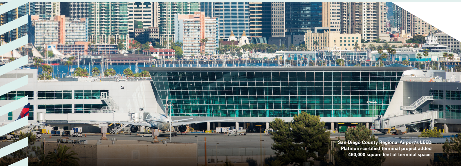
San Diego County Regional Airport's LEED Platinum-certified terminal project added 460,000 square feet of terminal space.