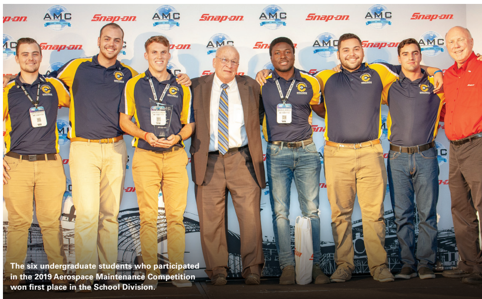
The six undergraduate students who participated in the 2019 Aerospace Maintenance Competition won first place in the School Division.

Embry-Riddle Air Force ROTC Honor Guard and drill teams placed first in all competition categories and won the Southern California Invitational Drill Meet (SCIDM) Senior Championship award at the 54th annual SCIDM.