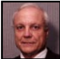
Charles Parker EXHIBITS