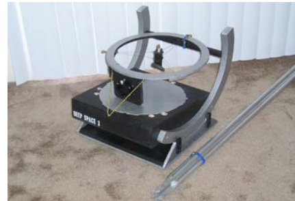
Deep Space 3 Telescope http://user.xmission.com/~alanne/DS3/DS3Main.html

Our design focuses on compactness and portability, allowing the users to easily store it in the back of a car and carry it to an observing location. It has an 8 inch mirror and a total focal length of 1200mm. The basic design is known as a truss tube assembly, where instead of a solid tube, the telescope's secondary mirror rests at the ends of four poles. This allows disassembly of the scope for transport. This is a popular design among amateurs, as shown by the image below, on the left. Once complete, our telescope will appear similar to this design, as demonstrated by the CAD Design on the right.