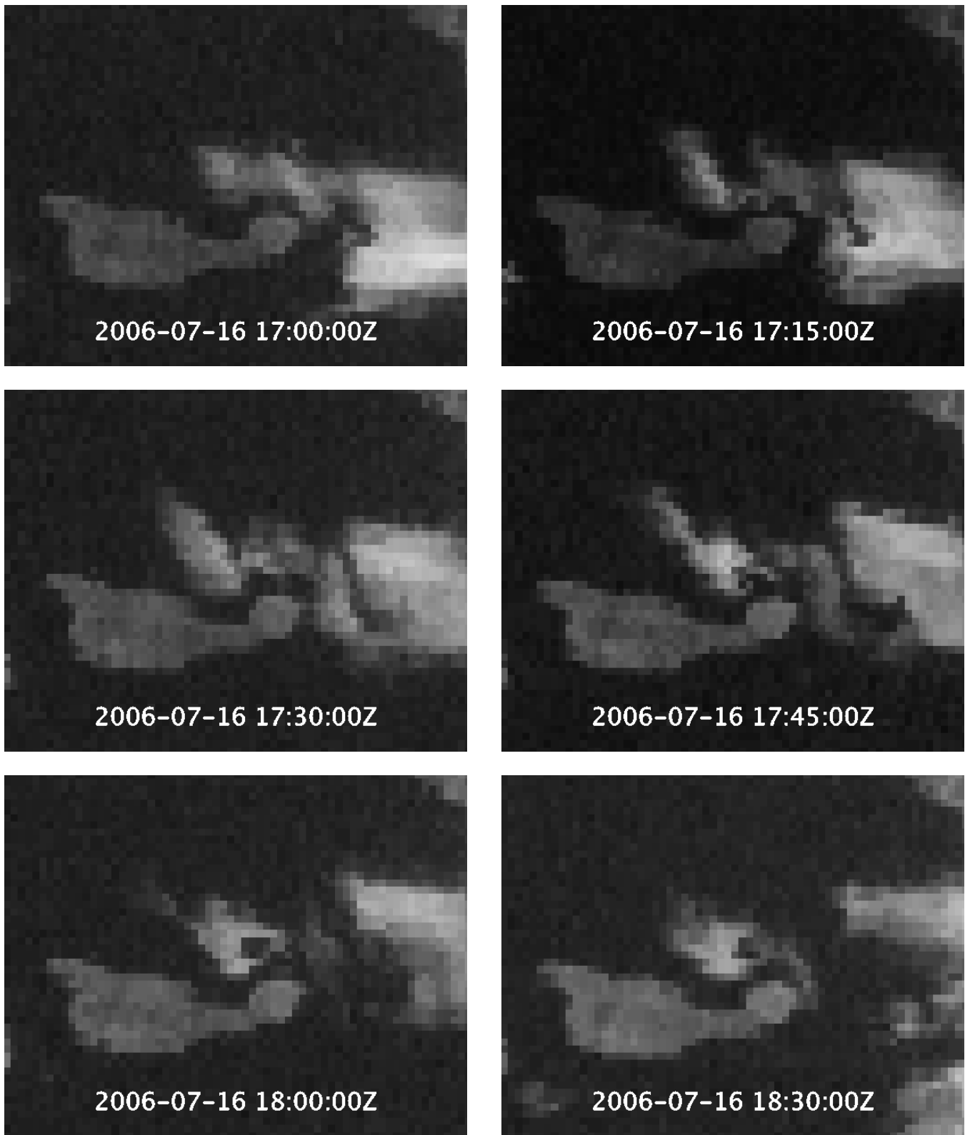
Figure 2. GOES-West visible satellite images from 1700 UTC to 1830 UTC on 16 July 2006. In this sequence, dry, cloud-free air in the lee of Santa Cruz Island can be seen moving laterally into the circulation followed by a tongue of clouds wrapping around and closing off the eye. The satellite image from 1830 UTC shows the same cloud as Fig. 1. North is “up” or toward the top of the page (cf. Fig. 1).