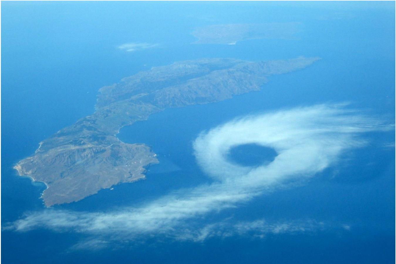
Figure 1. Aerial photograph of a stratocumulus cloud vortex just north of Santa Cruz Island on 16 July 2006 at 1126 PDT (1826 UTC), viewing toward the southwest. Click image for an external version; this applies to all figures hereafter.

in both the satellite (Fig. 2) and the photographic (Fig. 1) images, including the tongue of clouds extending from the tip of Santa Cruz Island toward the eddy, striations in the stratus clouds on the northwestern side of the eddy, and the circular, cloud-free eye. Analysis of the 1830 UTC satellite image indicates that the circulation had a width of 9–10 km and length of 25 km, thus straddling the line between the meso-gamma (2–20 km) and meso-beta (20–200 km) scales (Orlanski 1975). The cloud-free eye was 3 km in diameter.