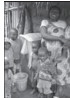
The Manz Biosand Filter shown in this photo was constructed by members of the community in Nkuv, Cameroon, West Africa, after receiving training from Hope College engineering and nursing students.

The spring break trip was followed by a pilot implementation trip in May 2006. At the conclusion of the May trip, it was still evident that our team was really comprised of three separate discipline specific teams engaging only superficially in interdisciplinary work. Each group was still developing and testing their area of expertise. Once the students were proficient in their discipline specific areas, we saw a shift in thinking and interaction among the students.